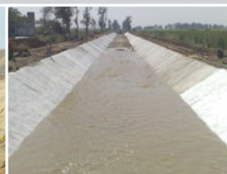
CANAL LINING WORKS