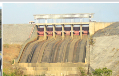
DAM CONSTRUCTION WORKS